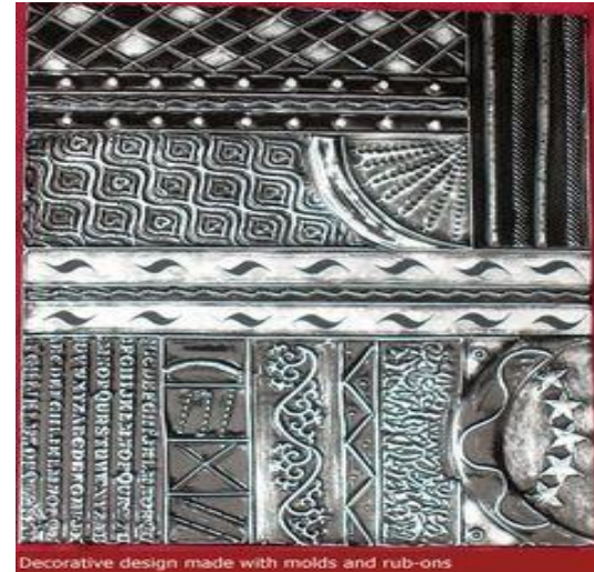
Decorative design made with molds and rub-ons